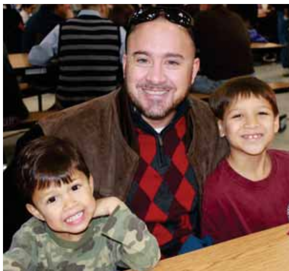
Students enjoy honoring their dads and veterans.