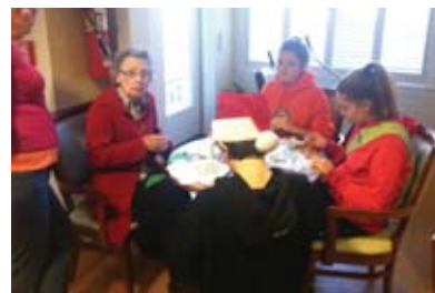
CYM teens spread Christmas love at Heartfields Assisted Living