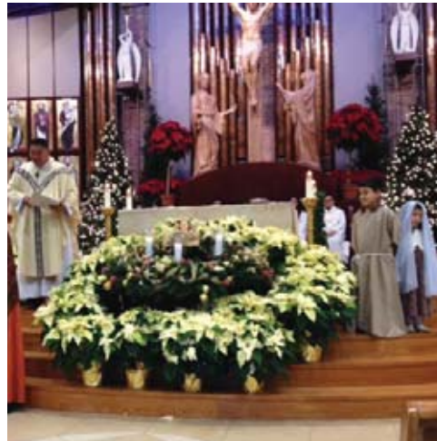
The children at the Spanish Mass on Jan. 5 re-enact the visit of the Three Kings.