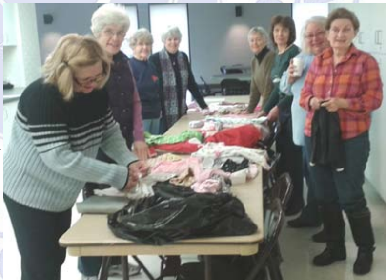
Ladies of the CCW sort through just some of the items donated to their annual "Virtual Baby Shower."

The "Second Option" of the St. Mary Men's Group meets the first Thursday of each month. The next meeting is February 6 at the Blue & Grey Brewery. Happy hour at 6:30 pm followed by open discussion