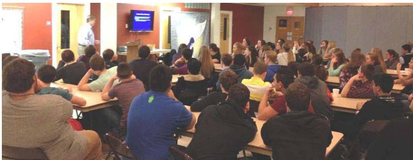
Our Sunday night High School students listening to a presentation on Evolution and Creation presented by the Catholic Apologetics Institute of North America (CAINA). Our student learned how science and faith are united for the same common goal of seeking God.

weekend of fun, faith, friends and growing in our relationship with God. Retreats are by far one of the greatest programs Youth Ministry offers so don't miss it! Space is limited and fills up very quickly so get your permission slip and $40 in by Monday, February 10th. Permission slips are available on our website as well as our promo video.