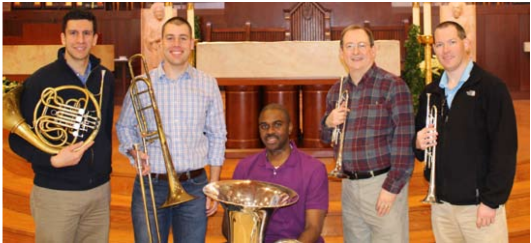
Ephrem Brass members are all outstanding brass players from the premier military service bands in Washington D.C. No ticket is required. Dessert reception following.