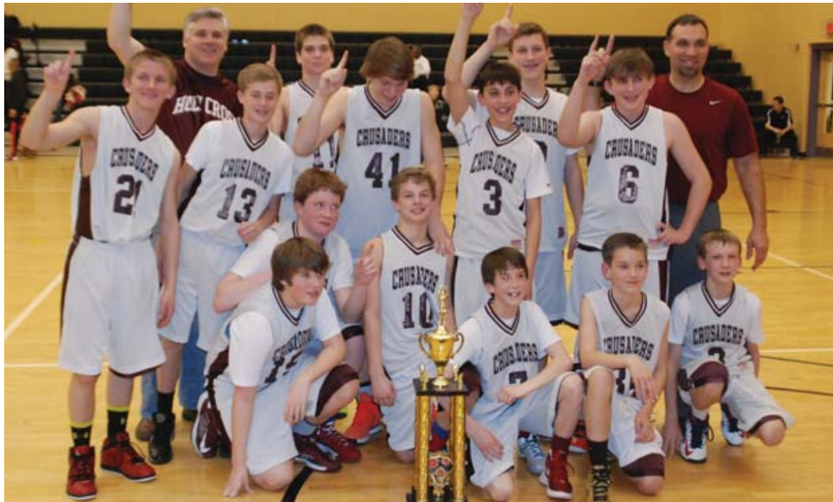
HCA Boys Basketball, 2014 VCAC Champions