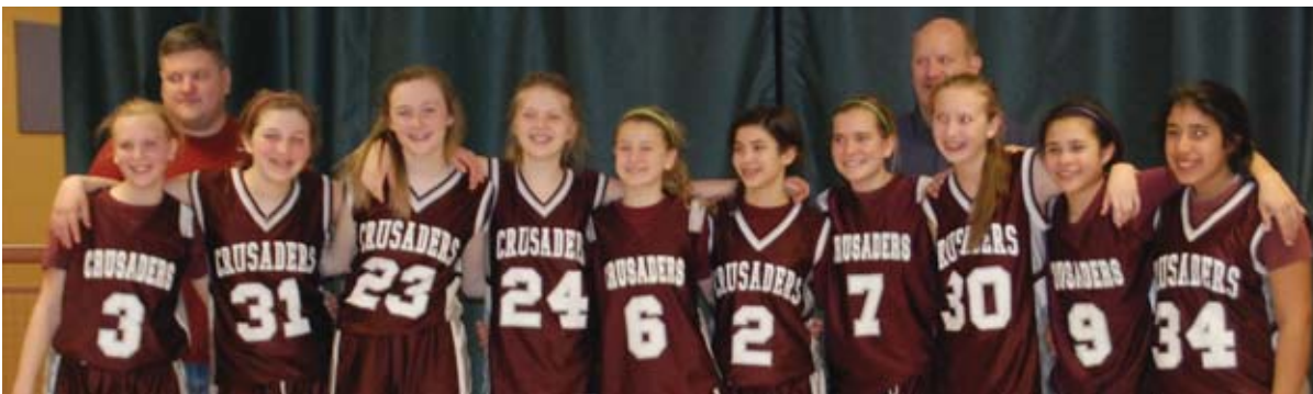
2014 Girls Varsity Basketball Team