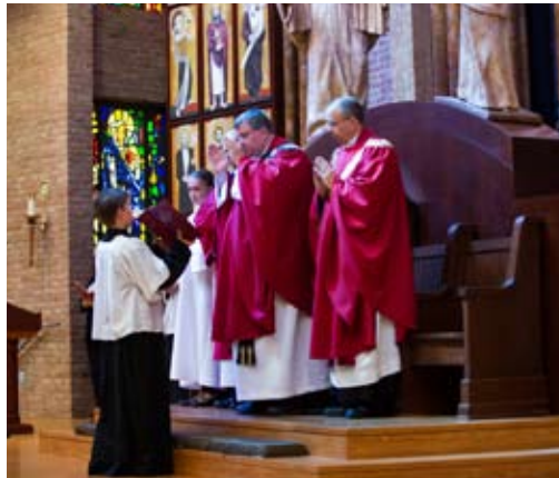
The Good Friday liturgy of The Lord's Passion, Veneration of the Cross