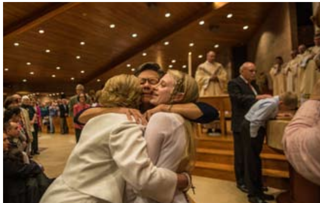
Easter Vigil and celebration of the Sacraments