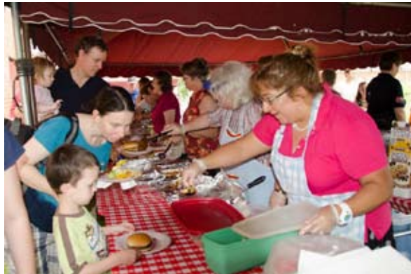
Scenes from the 2013 Picnic & Family Fun Day