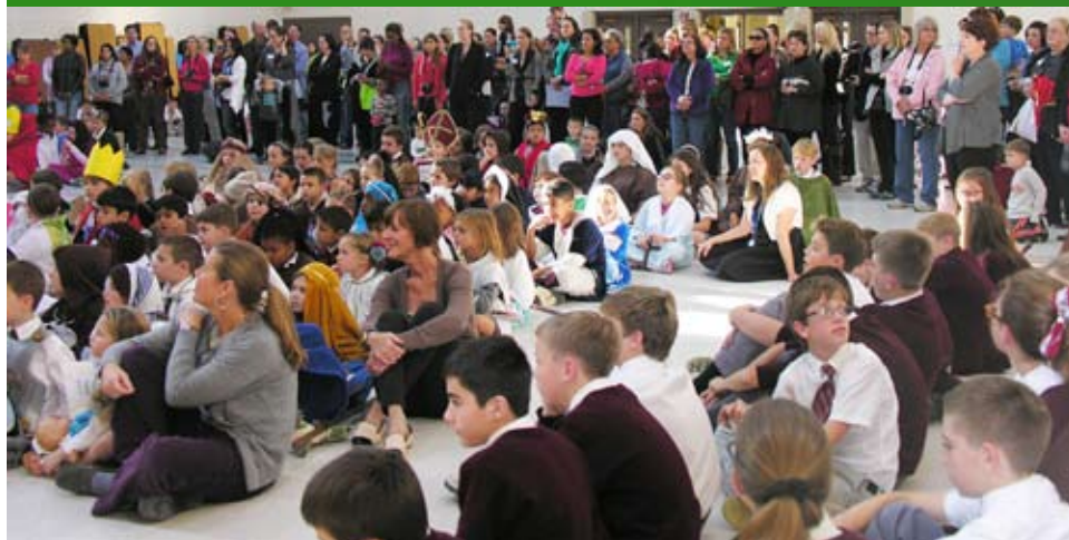
All Saints and parents gathering at Holy Cross for the feast of All Saints.