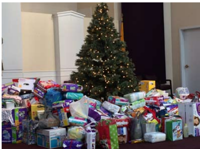
Holy Cross students partner with Catholic Charities to provide for needy babies in our area. Children come in laden with boxes of diapers, lotion and creams, gift cards to area stores, and tiny outfits for our little friends.

Al Anon is for those who have been affected by someone else's drinking, and members come together to learn a better way of life and how to find happiness. Especially at this time of year, it's important to know that you are not alone and there is help. There is an Al Anon meeting every Saturday at 10am in Room 204 of St. Mary's Parish Life Center.