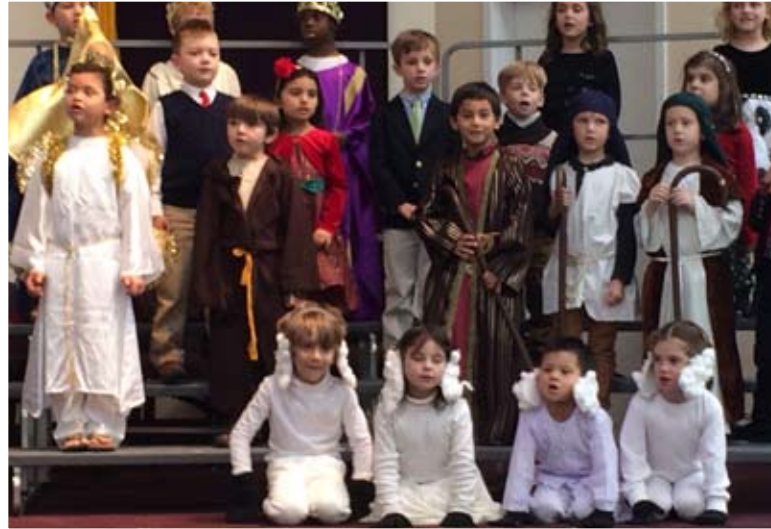
Scenes from Holy Cross Academy's Christmas events celebrating the birth of Jesus.