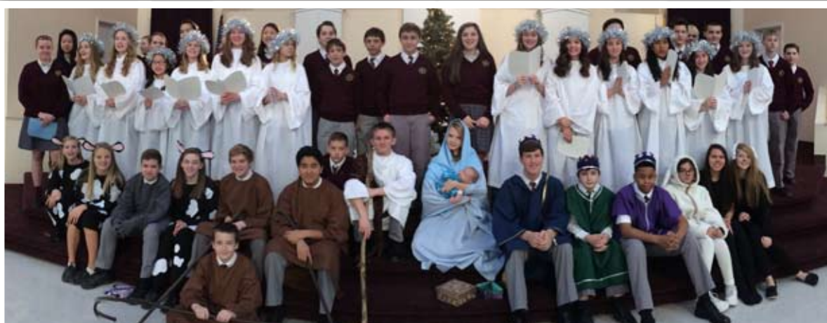
Holy Cross Academy's Living Nativity.