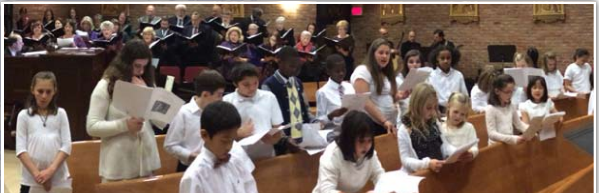
Lessons and Carols, December 17, 2014