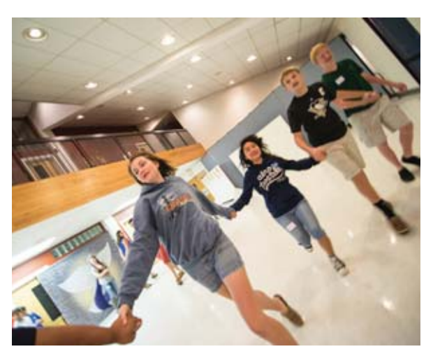
High School Youth Group

Blessed and Happy New Year - May your aspirations, hopes and resolutions for 2014 bring you closer to Christ.