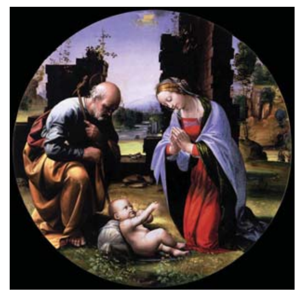
Fra Bartolomeo The Adoration of the Christ Child, c. 1499

3. And one more thought we can take from God's word: the family experiences joy. In the responsorial psalm we find these words: "let the humble hear and be glad" (33/34:2). The entire psalm is a hymn to the Lord who is the source of joy and peace. What is the reason for this gladness? It is that the Lord is near, he hears the cry of the lowly and he frees them