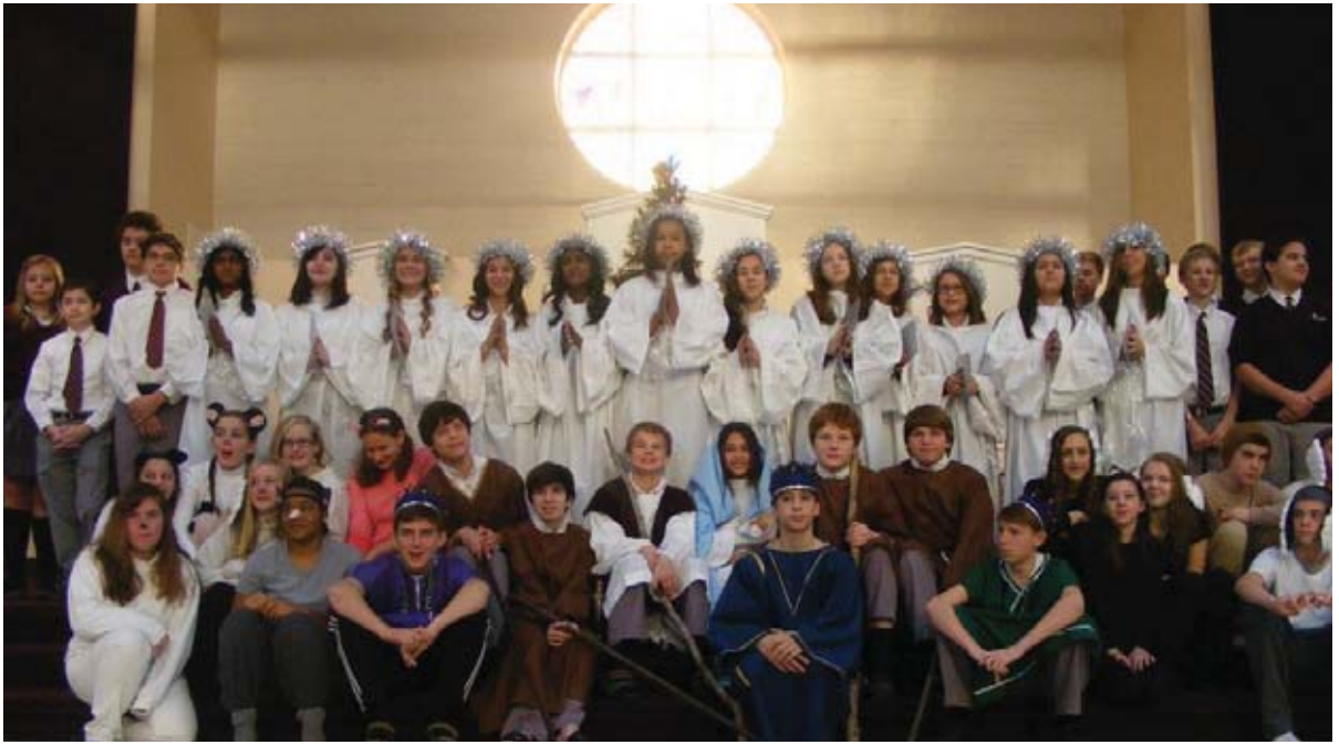
Students participate in the preparation activities of Advent.