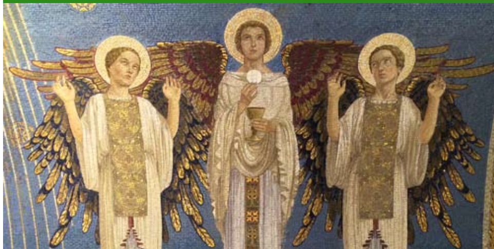
Mosaic at the altar, Basilica of the Transfiguration, Mount Tabor.

Saint Mary of the Immaculate Conception Roman Catholic Church FREDERICKSBURG, VIRGINIA