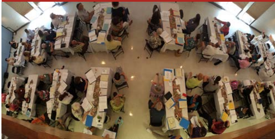
Parish Leadership at Called and Gifted Workshop, September 6

Saint Mary of the Immaculate Conception Roman Catholic Church FREDERICKSBURG, VIRGINIA