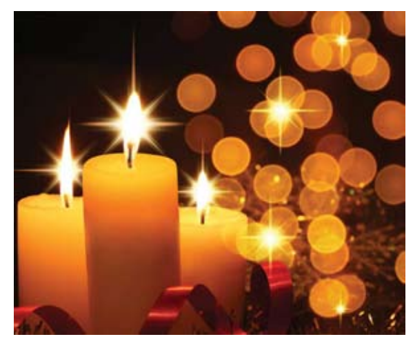
Tuesday, December 16, 2014 at 7:30pm

A service of Scripture Readings and Music celebrating the Advent Season.