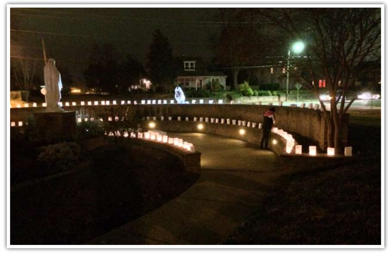
On December 8, luminaria illuminated the front of Saint Mary Church in celebration of the feast day of the Immaculate Conception of the Blessed Virgin Mary.

For Unto Us a Child Is Born, Christ the Savior! —This Advent, include a Gift for Life on your Christmas List by supporting Project Rachel or the Gabriel Project. It is easy to make a small, taxdeductible contribution as a gift in the name or memory of a family member or friend, and it will make a big difference in a woman's life. You have the opportunity to assist a frightened young woman who has just learned she is pregnant, or a woman who opted to abort her child and is now experiencing the after effects of her choice. Your gift