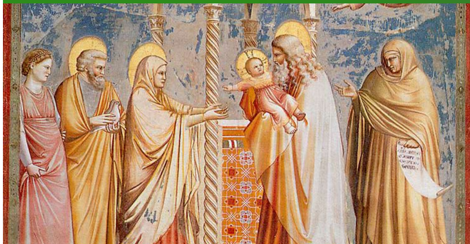
Giotto's "Presentation of the Lord," 1304

Saint Mary of the Immaculate Conception Roman Catholic Church FREDERICKSBURG, VIRGINIA