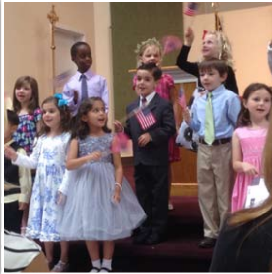
Students enjoy their Kindergarten celebration.