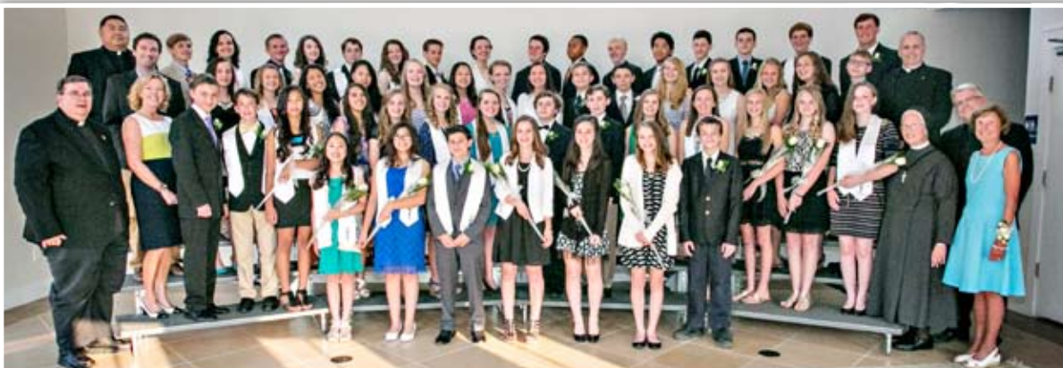
Congratulations to Holy Cross Academy's 8th grade graduates.