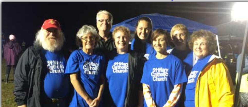
Parishioners welcome visitors to the Saint Mary tent at the Hope Over Heroin event held September 25-26 at Pratt Park.