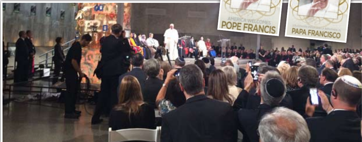
right and below right: Pope Francis at Foundation Hall in the 9/11 Memorial Museum for the interreligious prayer service on Friday, September 25th.