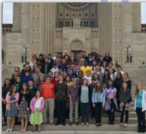
On October 24, confirmation teams 1-11 traveled to the Basilica of the Shrine of the Immaculate Conception in Washington, D.C. for their confirmation retreat.