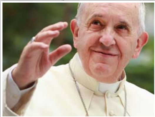
Text of Pope Francis' Rescriptum Ex Audientia on Implementing the New Law on Annulment Proceedings.

Pope Francis signed Rescriptum ex audientia on the implementation of and compliance with the new law on procedures for the declaration of nullity of marriage on the afternoon of December 7, 2015.