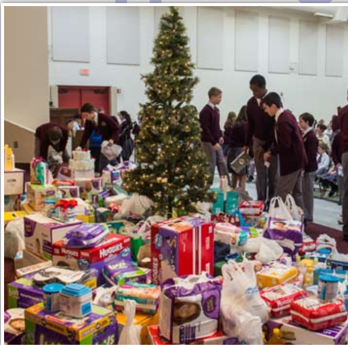
Holy Cross Academy's Advent Tree: Students donate diapers, baby lotion, formula and everything else that is needed to take care of God's precious children. These items are donated to the 'Baby Closet' at Catholic Charities.