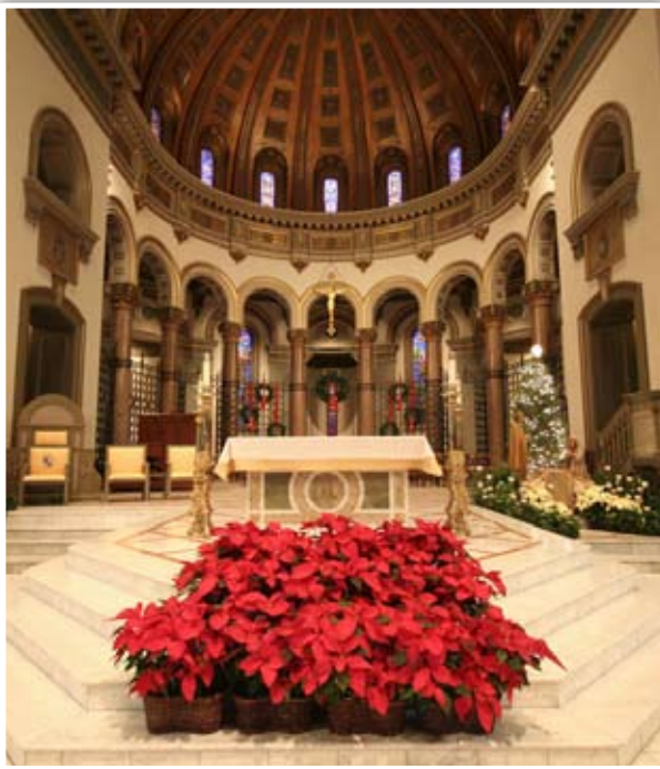
Cathedral of the Sacred Heart, 800 S. Cathedral Place, Richmond, Virginia.

As the 2016 Virginia General Assembly session nears, the Virginia Catholic Conference is planning special prayer and advocacy events to enable Catholics throughout the Commonwealth to make a positive impact on what happens in Richmond this winter.