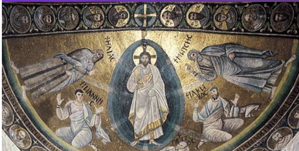
Mosaic of the Transfiguration, Saint Catherine Monastery, Sinai

Saint Mary of the Immaculate Conception Roman Catholic Church FREDERICKSBURG, VIRGINIA