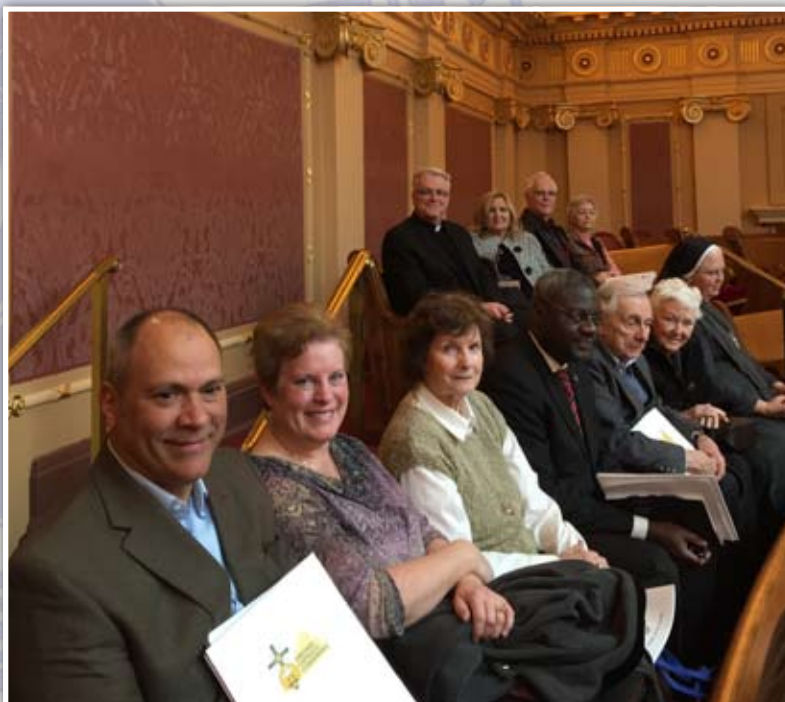
On February 17, Saint Mary parishioners traveled to Richmond and participated in "Catholics in the Capitol."

"Yo les aseguro que, cuando lo hicieron con el más insignificante de mis hermanos, conmigo lo hicieron" (Mt 25:40). Hoy se nos recuerda que Jesús se identificó con nuestros hermanos y hermanas más pobres. La Catholic Relief Services Collection sirve a Jesús en las víctimas del