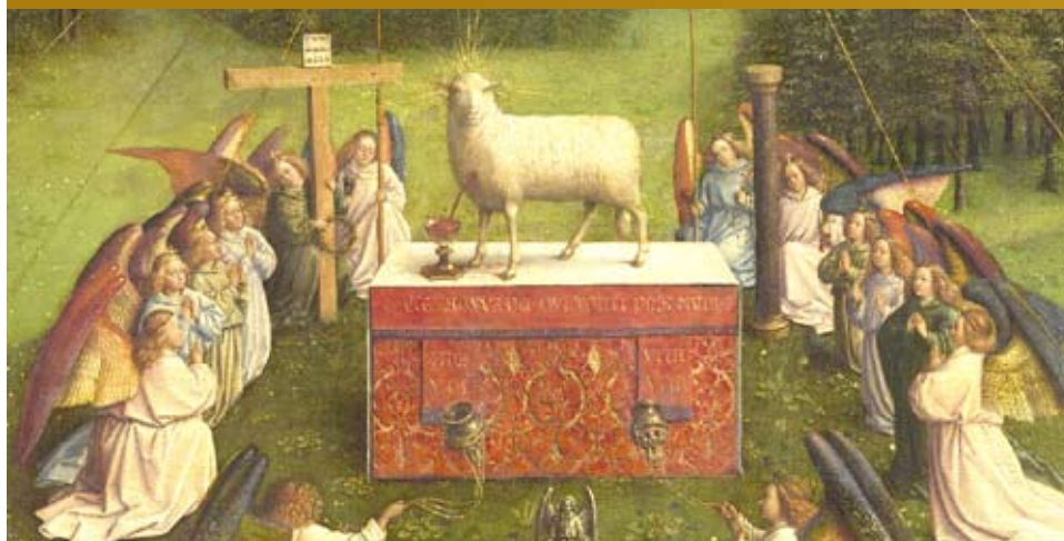
Adoration of the Mystic Lamb, detail of the Ghent Altarpiece by Jan van Eyck.

Saint Mary of the Immaculate Conception Roman Catholic Church FREDERICKSBURG, VIRGINIA