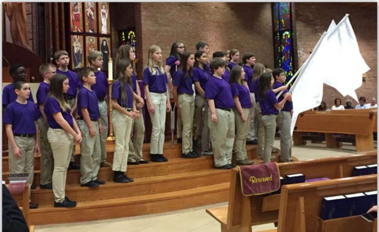
6th Graders from Holy Cross Academy perform our Wednesday of Holy Week tradition, "The Tale of the Three Trees."