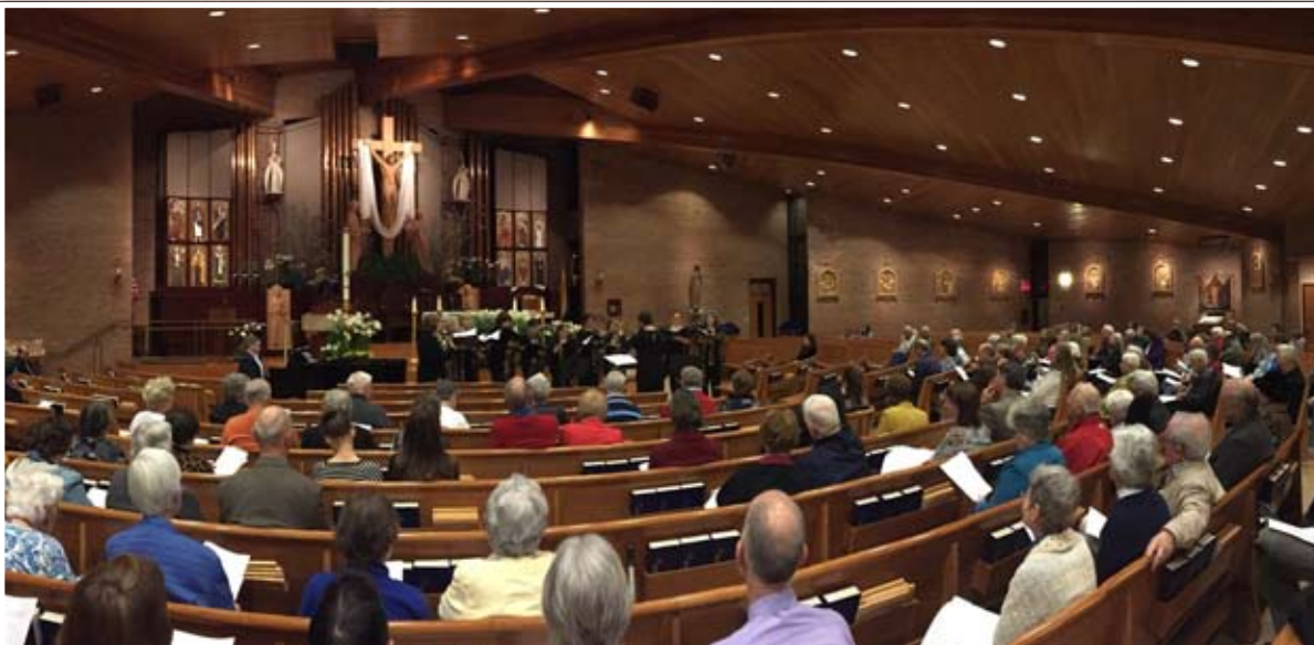
The female vocal ensemble, Voix de Femmes, and guest instrumentalists, performed at Saint Mary on Friday, April 8 as part of the "Free Concerts at Saint Mary" series.

One of the Patriots from our American Heritage Girls Troop VA0128 is working on her Stars and Stripes Project to benefit the St. Mary Preschool. She will build a storage unit for the music class. Donations are being accepted outside of Mass this weekend. Please help support her efforts.