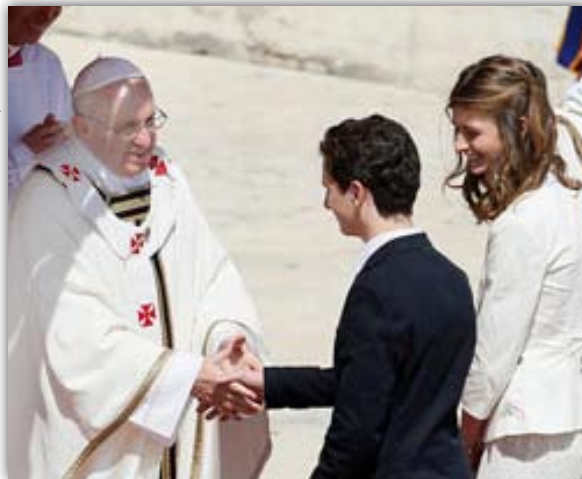
Pope Francis greets newly confirmed young people as they bring up the offertory gifts during a recent Mass in St. Peter's Square, in which the Pope confirmed 44 people from 22 countries.

"Let us be guided by the Holy Spirit, allow him to speak to our hearts and he will tell us this: that God is love, he's always waiting for us, he is a father who loves us like a real dad and only the Holy Spirit can tell our hearts this," he said.