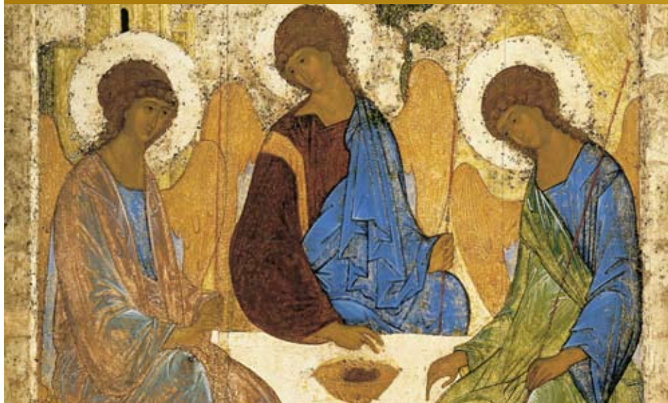
Trinity, 15th century icon by Andrei Rublev