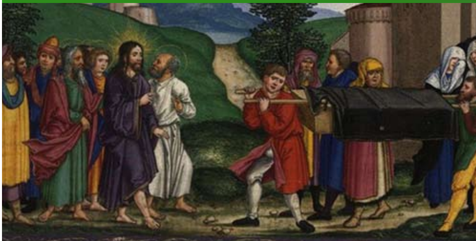
Resurrection of the Widow's son from Nain

Saint Mary of the Immaculate Conception Roman Catholic Church FREDERICKSBURG, VIRGINIA