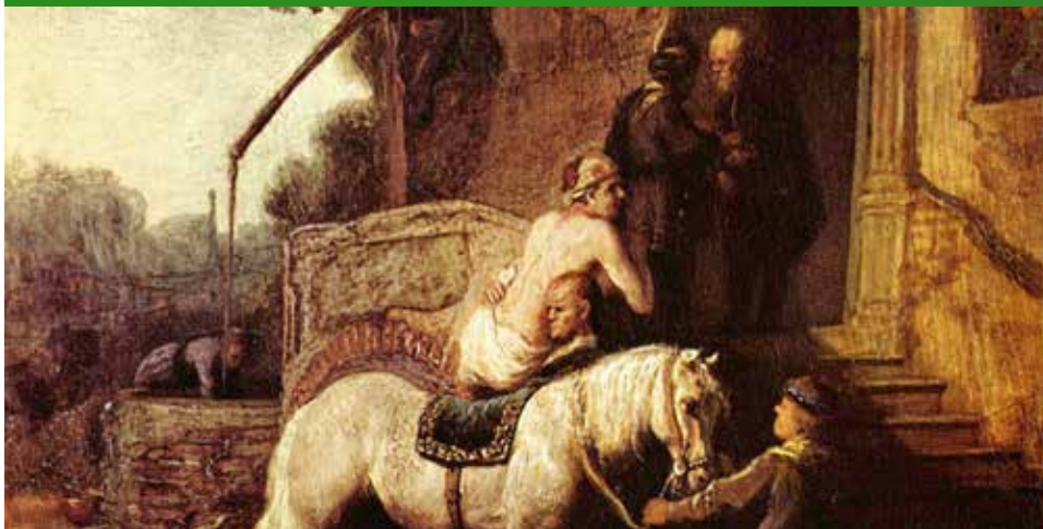
The Good Samaritan by Rembrandt (1630).

Saint Mary of the Immaculate Conception Roman Catholic Church FREDERICKSBURG, VIRGINIA