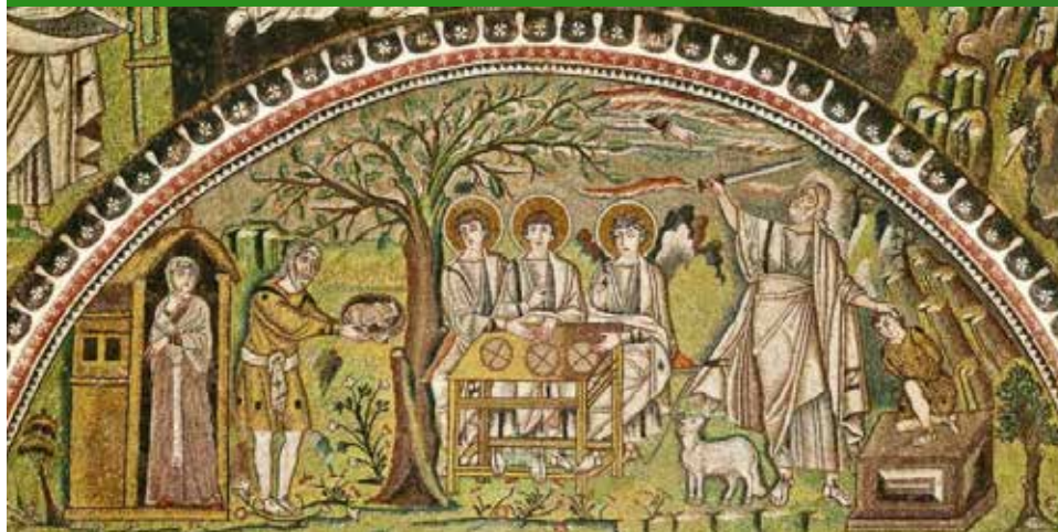
The Hospitality of Abraham. Basilica di San Vitale. Ravenna, Italy.

Saint Mary of the Immaculate Conception Roman Catholic Church FREDERICKSBURG, VIRGINIA