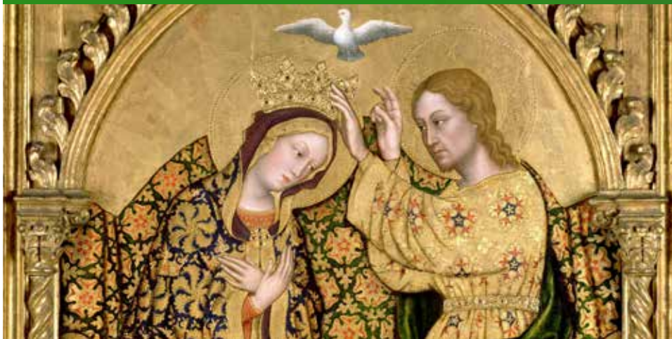
The Coronation of the Virgin, Gentile da Fabriano (1422-1425).

Saint Mary of the Immaculate Conception Roman Catholic Church FREDERICKSBURG, VIRGINIA