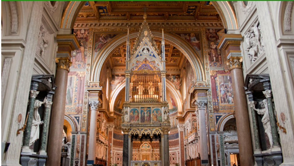
St. John Lateran Basilica, Rome, Italy

Saint Mary of the Immaculate Conception Roman Catholic Church FREDERICKSBURG, VIRGINIA