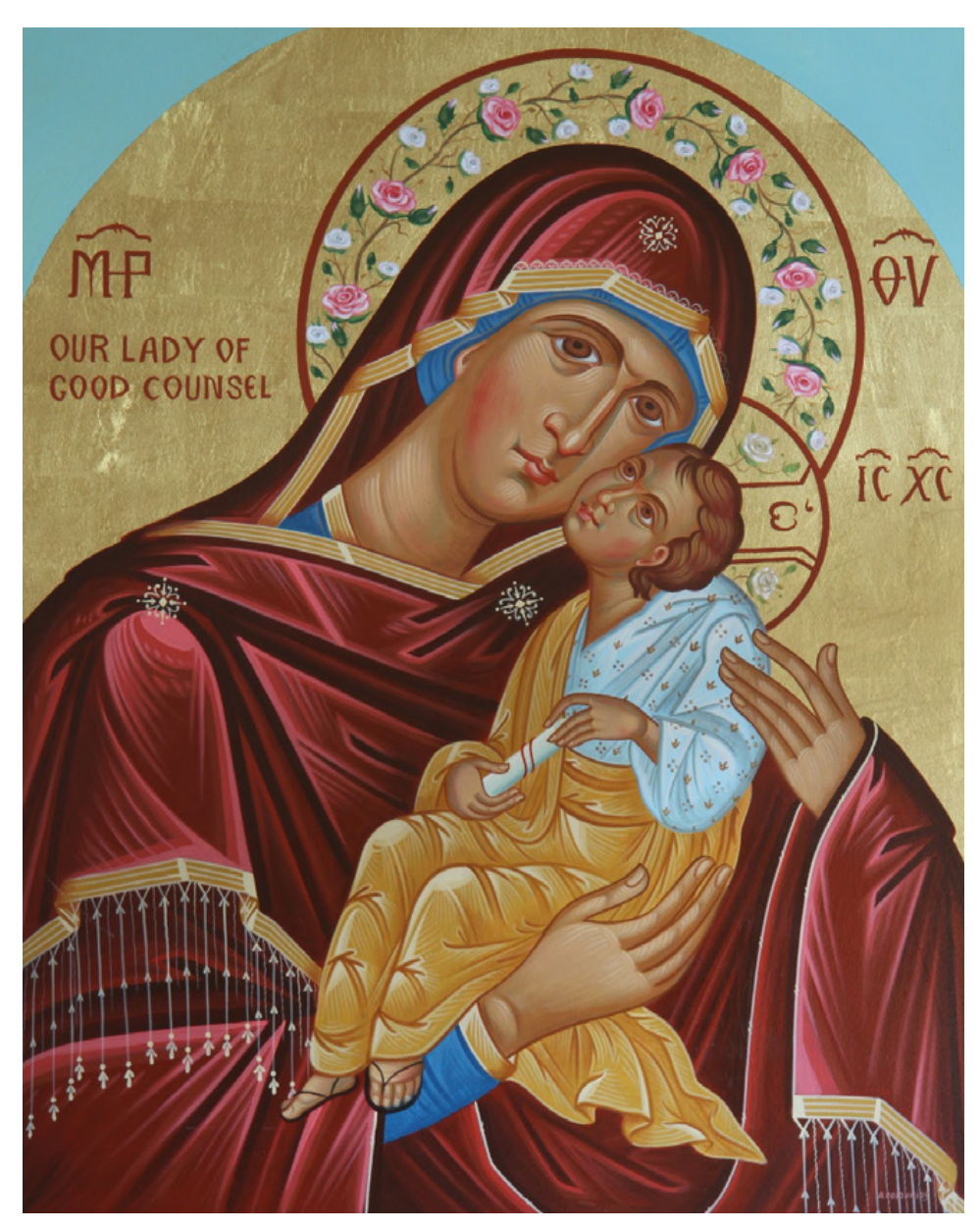
The Solemnity of Mary