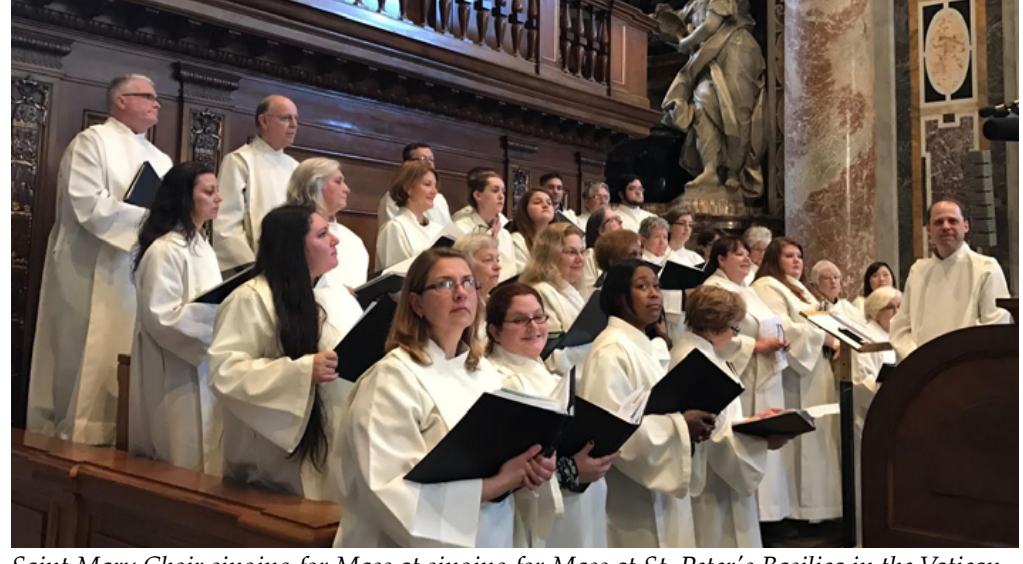
Saint Mary Choir singing for Mass at singing for Mass at St. Peter's Basilica in the Vatican. We will sing for the Papal Mass in St. Peter's February 2 for the Feast of the Presentation of the Lord. For more, go to our Facebook page Saint Mary Adult Choir Fredericksburg.

For those that do not have a cell phone but wish to join, you can do so via the internet. Please visit new.flocknote.com/ StMaryCatholicChurchFre1/ GlobalPrayerMin.