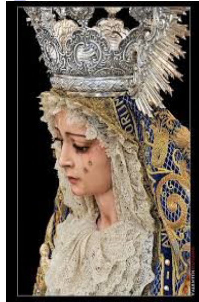
Our Lady of Czestochowa

Airport Taxes/Security Fees Included Single Supplement: $425 Travel Insurance $199