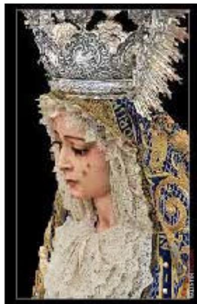
Our Lady of Czestochowa