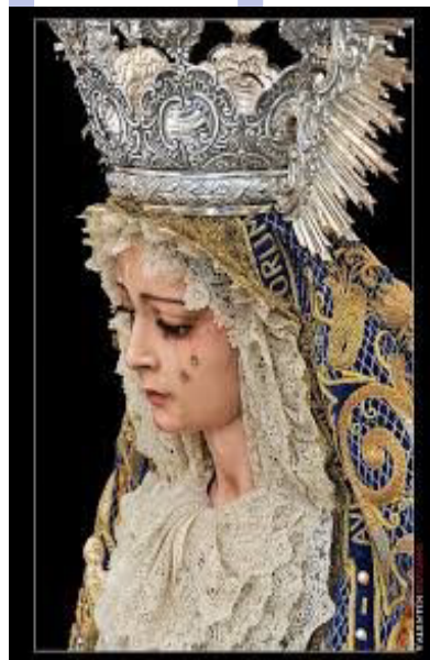
Our Lady of Czestochowa

Airport Taxes/Security Fees Included Single Supplement: $425 Travel Insurance $199