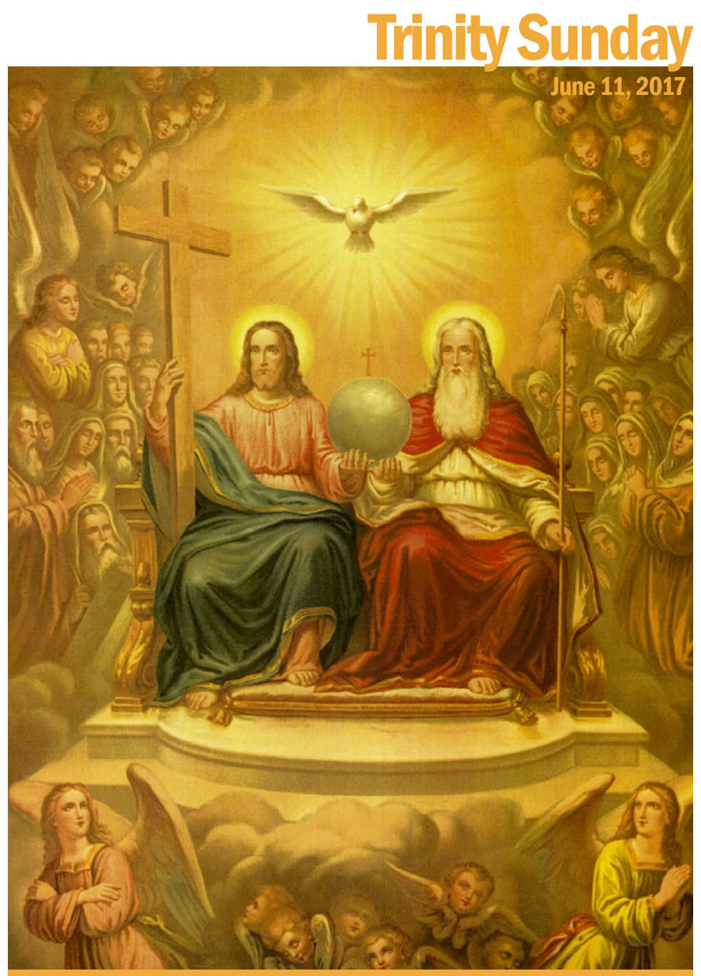
Saint Wary of the Immaculate Conception Roman Catholic Church