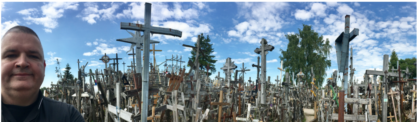
Trip wrapped up with visit to Hill of Crosses in Lithuania