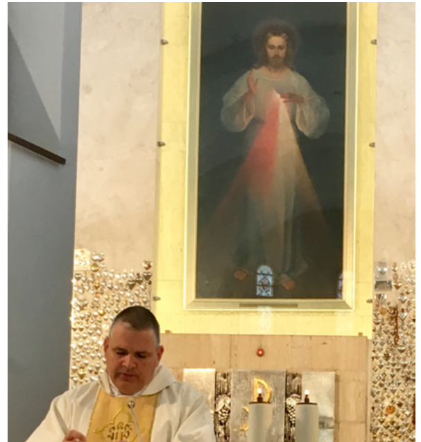
Original painting of Divine Mercy (Vilnius, Lithuania)