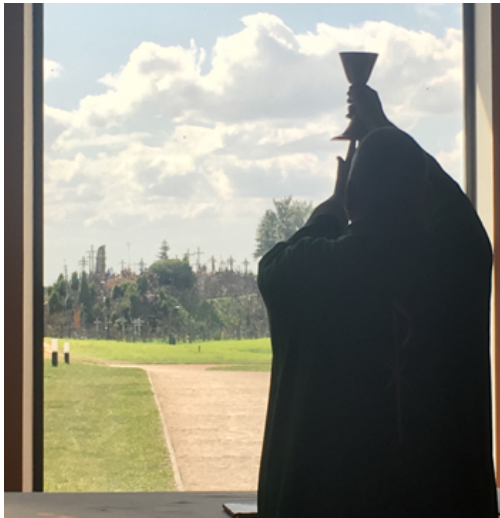
Mass at Hill of Crosses