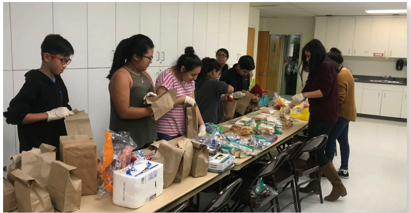
Above a Confirmation team packages lunches for the Stafford Junction Brain Builders program.

We will then head to the March for Life in Washington, D.C. in prayerful protest and March to the Supreme Court for an end to Roe vs. Wade. Permission slips are available on our website. Space is limited, sign up early!