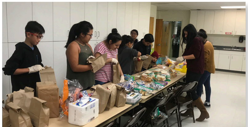
Above a Confirmation team packages lunches for the Stafford Junction Brain Builders program.

We will then head to the March for Life in Washington, D.C. in prayerful protest and March to the Supreme Court for an end to Roe vs. Wade. Permission slips are available on our website. Space is limited, sign up early!