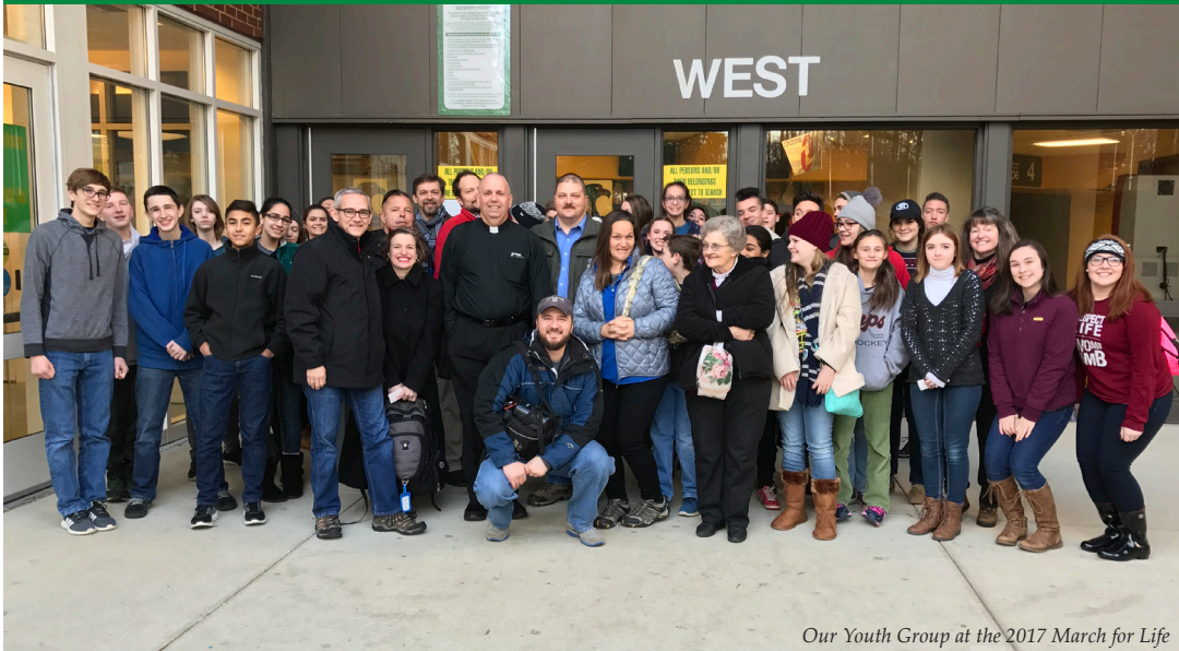
Our Youth Group at the 2017 March for Life

Saint Mary of the Immaculate Conception Roman Catholic Church FREDERICKSBURG, VIRGINIA