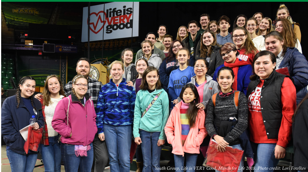
Youth Group, Life is VERY Good, March for Life 2018.

Saint Mary of the Immaculate Conception Roman Catholic Church FREDERICKSBURG, VIRGINIA