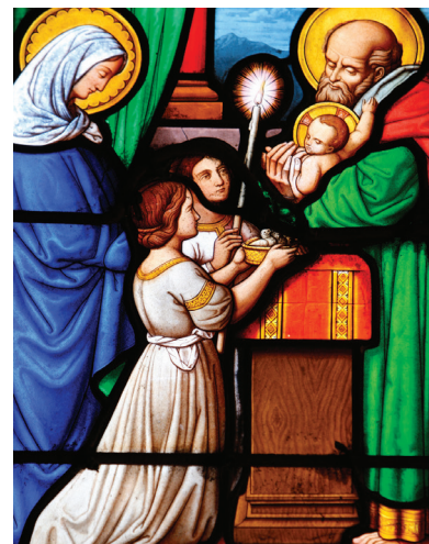
The Presentation at the Temple WORLD DAY FOR CONSECRATED LIFE

In 1997, Pope Saint John Paul II instituted a day of prayer for women and men in consecrated life. This celebration is attached to the Feast of the Presentation of the Lord on February 2nd. This Feast is also known as Candlemas Day, the day on which candles are blessed symbolizing Christ who is the light of the world. So too, those in consecrated life are called to reflect the light of Jesus Christ to all peoples. The celebration of World Day for Consecrated Life is transferred to the following Sunday, this year on February 4, in order to highlight the gift of consecrated persons for the whole Church. Please pray for all those who have made commitments in the consecrated life, and be sure to thank them on their special day. May they continue to be inspired by Jesus Christ and respond generously to God's gift of their vocation.