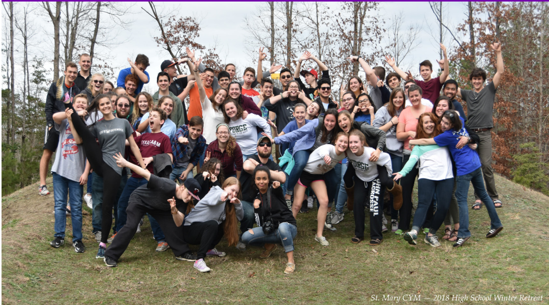
St. Mary CYM — 2018 High School Winter Retreat

Saint Mary of the Immaculate Conception Roman Catholic Church FREDERICKSBURG, VIRGINIA