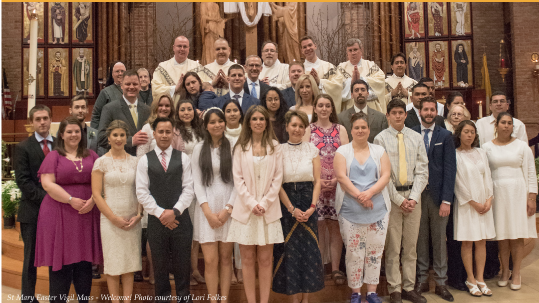
St. Mary's Easter Vigil Mass - Welcome!

Saint Mary of the Immaculate Conception Roman Catholic Church FREDERICKSBURG, VIRGINIA