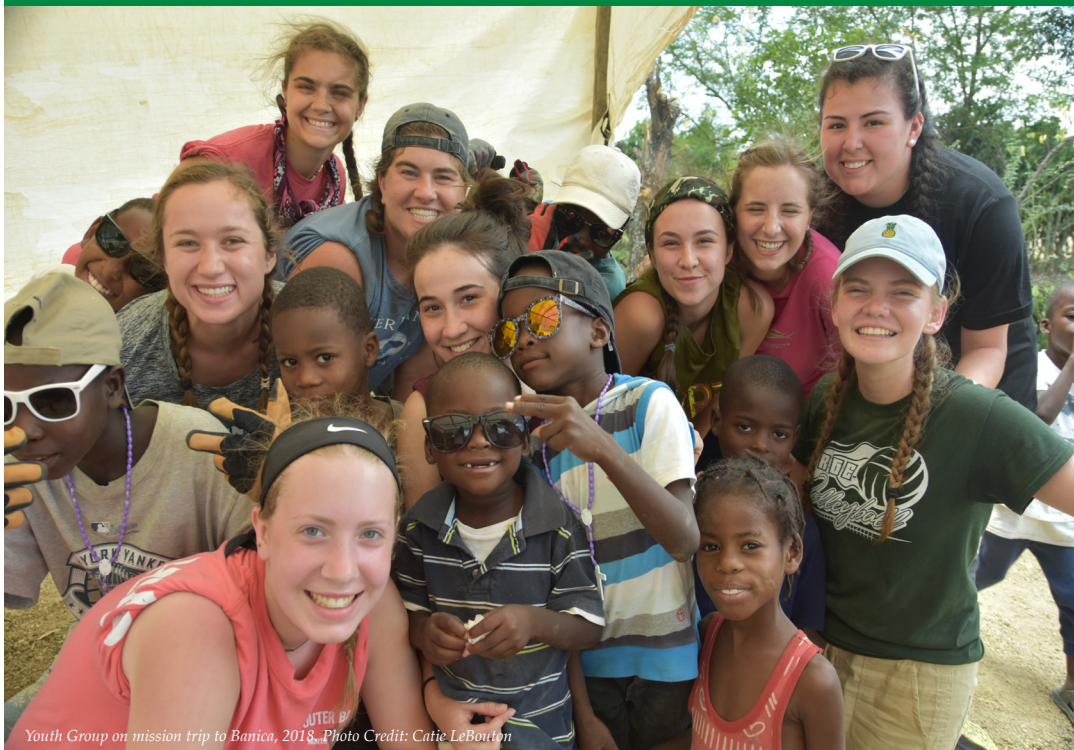
Youth Group on mission trip to Banica, 2018.

Saint Mary of the Immaculate Conception Roman Catholic Church FREDERICKSBURG, VIRGINIA