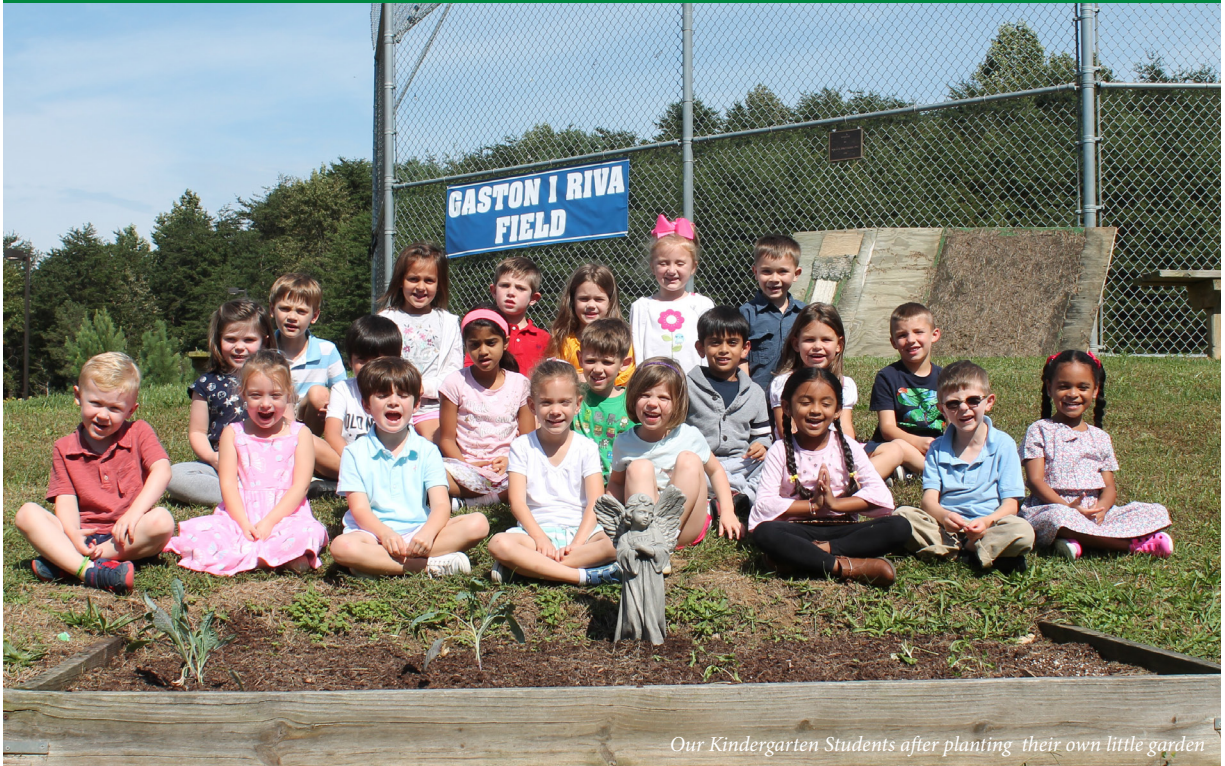
Our Kindergarten Students after planting their own little garden

Saint Mary of the Immaculate Conception Roman Catholic Church FREDERICKSBURG, VIRGINIA