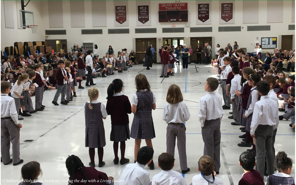
Children of Holy Cross Academy ending the day with a Living Rosary.

Saint Mary of the Immaculate Conception Roman Catholic Church FREDERICKSBURG, VIRGINIA