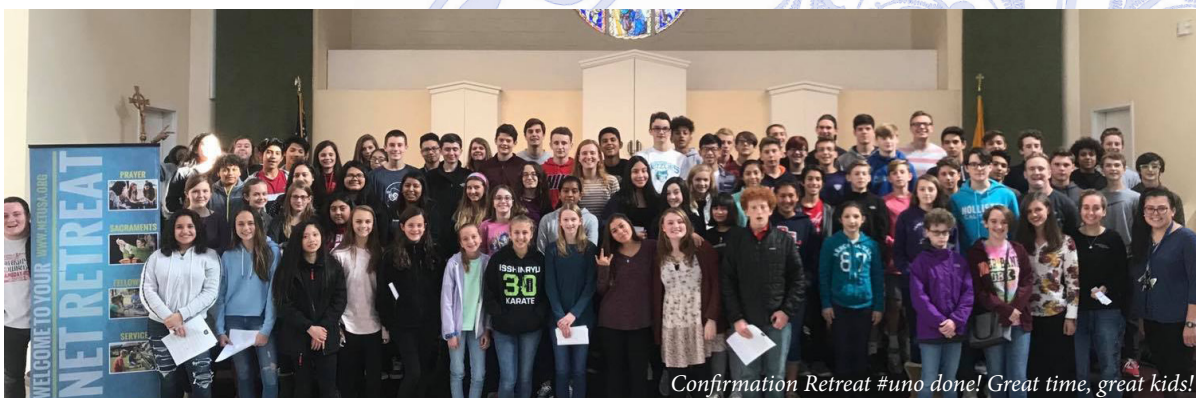
Confirmation Retreat #uno done! Great time, great kids!

Be sure to stay in the know with St. Mary CYM by visiting stmmaryfred.org/youth-ministry