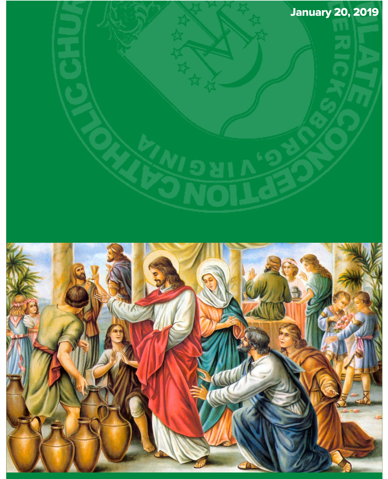
Saint Mary of the Immaculate Conception Roman Catholic Church 1009 STAFFORD AVENUE - FREDERICKSBURG, VIRGINIA